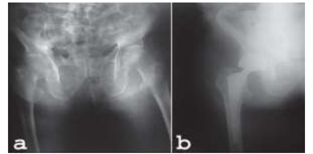
Figure 2: (a) Pelvis radiograph of a female with a right femoral neck fracture. (b) After 3-months the Followup X-ray of the same patient.