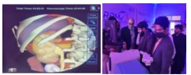
Figure 2: Literature shows residents taught on simulators had somewhat better summative scores.

Endoscopic Workspaces: Endoscopic platforms imitate upper and lower urinary tract operations. Cystoscopy, ureteroscopy, TURP, TURBT, and percutaneous nephrolithotomy are simulated (PCNL). 6 Using training platforms is helpful for PCNL, where the learning curve is 40–65.<sup>12</sup>.