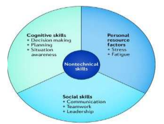
Figure 3: Simulation-based training and assessment in urological surgery

Laparoscopic Workspaces: Laparoscopic surgery simulators are either physical boxes or videos. These use genuine laparoscopic surgical devices to familiarize learners with them (Figure 2) Learners can pass things, cut, suture, and tie using surgical equipment. Laparoscopic platforms help surgical trainees learn laparoscopic techniques. Using reality-based or virtual reality-