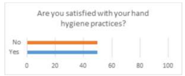
Figure 2: Self-reported satisfaction with hand hygiene practices

A total of 60% of the respondents wash their hands before and after touching each patient. However, 30% of respondents only wash hands after touching each patient and 10% of the participants only wash hands before touching every patient. Only