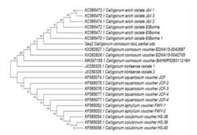
Figure 2. Maximum Likelihood (ML) tree using rbcL gene sequences for the species of Calligonum .

Phylogeny using rbcL gene: The species Calligonum arich isolates Jbil1, isolates Jbil3 are likely as sister taxa similarly to C. colubrinum voucher HS-39, HS-40. The species suchas Calligonum arich isolate Jbil2, Calligonum arich isolate ElBorma, Calligonum arich isolate ElBorma 1, C. korlaense isolate 1, 2, C. squarrosum, C. aphyllum are more closely related sharing common ancestor as shown in the Figure 2.