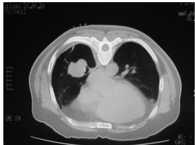
Fig 1. Marking of the lesion and localization before biopsy